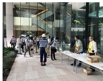
Training for accommodating stranded commuters at Tokyo Square Garden