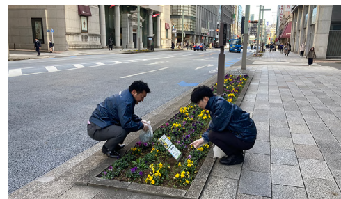
Flowerbed replanting on Chuo-dori Avenue sidewalks

utilizing timber from forest thinning at the Chuo-ku Marugoto Museum hosted by the organization.