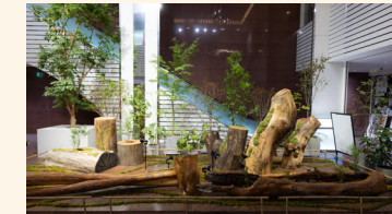
MOKUTEI on B2F of Tokyo Tatemono Yaesu Building

Tokyo Tatemono, Leave a Nest Co., Ltd., and multiple startups collaborated to launch the MOKUTEI project at the Tokyo Tatemono Yaesu Building, enabling urban residents to participate in the regeneration of natural forests. This project is an initiative to contribute to forest regeneration and biodiversity conservation by creating a garden using timber from Hinohara Village, Nishitama District, Tokyo, in the building's open space, having visitors to the building nurture seedlings, and then planting them in the forests of Hinohara Village after they have grown. By realizing resource circulation between urban and natural environments and offering urban residents a new sense of connection with nature, namely the feeling that they can contribute to forest regeneration and biodiversity conservation while remaining in the city, the project aims to improve the well-being of people and society.