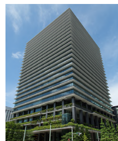
Tokyo Square Garden

When major earthquakes or other disasters occur, public transportation functions may halt, stranding commuters. At some of the large-scale office buildings managed by the Tokyo Tatemono Group, we have prepared support mechanisms for tenants. We have entered into agreements with local municipalities and developed systems, structures, and resource stockpiles in anticipation of scenarios in which stranded commuters require housing.