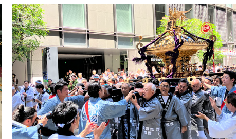
Sanno Festival (Mikoshi portable shrines)

Special Back Number: Tokyo Tatemono Urban Development Activities (published 2017) (Only available in Japanese)