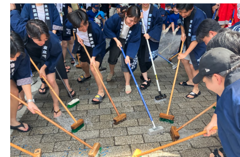
Nihonbashi Bridge cleaning (helping to clean the bridge)