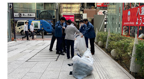
Morning Clean-up activities

The Tokyo Tatemono Group also works to beautify the city. Particularly in the YNK area, we regularly conduct cleanup activities to make areas look more attractive. Employees fits in these activities before starting work.