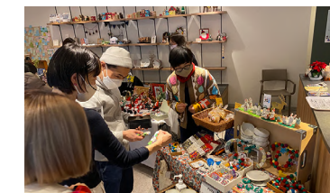
Interaction at Shakuji-ii BASE