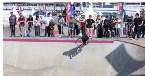
Skateboard park at livedoor URBAN SPORTS PARK