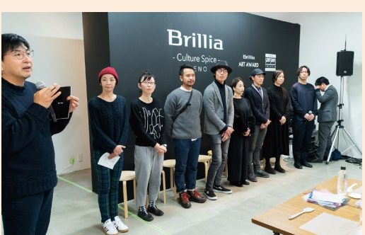
Selected Brillia ART AWARD Recognitions

Tokyo Tatemono sponsored the Brillia Culture Spice Brillia ART AWARD and Selected Works and Short Film Screening event at the Ueno Royal Museum in Taito-ku, Tokyo, between January 27 and 29, 2020. At this event, eight works were exhibited as winners of the Brillia ART AWARD.