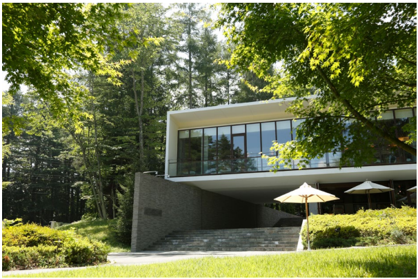
Regina Resort Fuji

These resorts offer guests a sense of ease as they stay with their pets, creating new demand for tourism and contributing to the economic development of their regions.