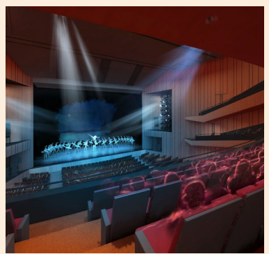
Tokyo Tatemono Brillia HALL (Inside)

A multi-purpose hall with 1,300 seats, the facility serves as a symbol of Toshima as an International City of Arts and Culture. The hall also serves as a center from which we promote a variety of cultural and art activities.