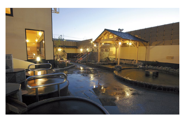
Ofuro no Osama Ebina

By providing a space where customers feel at ease, we contribute to revitalizing local communication and promoting the health of local residents.