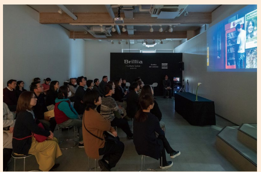
Short Film Screening