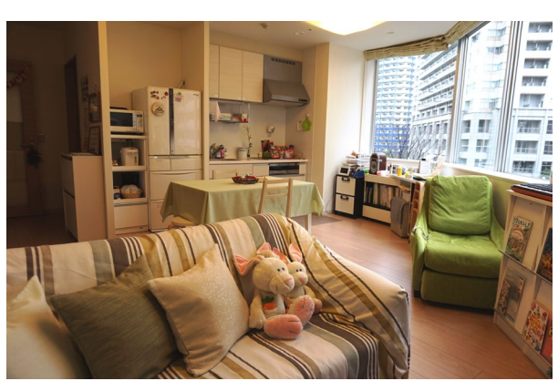
Brillia ist Tower Kachidoki Family House