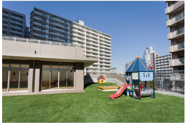
Garden of the Certified Center for Early Childhood Education Center Located in Brillia ist Tower Kachidoki

In 2019, donations were provided to the Oze Preservation Foundation, a conservation organization working to preserve the Oze marshland area, which is one of Gunma Prefecture's most iconic natural environments.