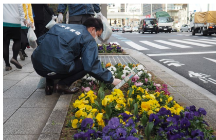
Chuo-dori Path Flower Beds