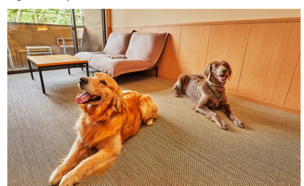
Regina Resort Hakone Ungaiso