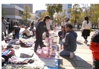
Flea Market Held in Central Park