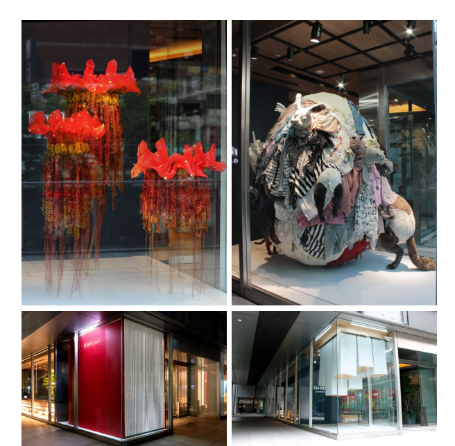
Works Exhibited in 2019 at THE GALLERY in Brillia LOUNGE

brillia.com/artaward/ https://brillia.com/artaward/archive.html (All available in Japanese only)