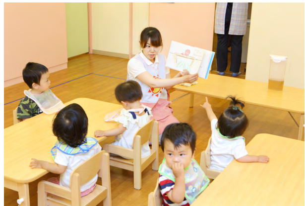
Kindergarten Building Children Spend Time Comfortably with Facilities and Specifications that Set Safety as the Top Priority