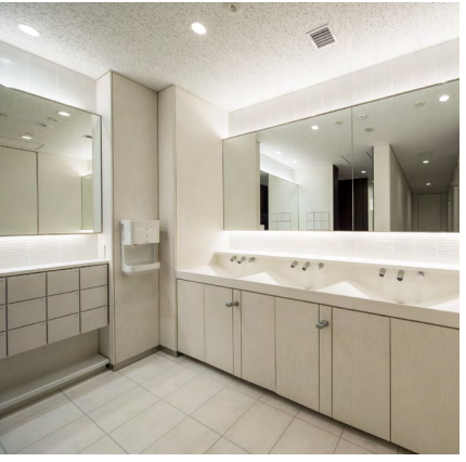
Installation of a Compartment in the Powder Corner of the Restroom with a Refreshing White Tone