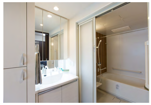
Suitable for Life in a Wheelchair

the one room units common to elderly residences, various room types up to a 2LDK are available depending on the property to provide a unique life suitable for each resident. Furthermore, the living environment has been built for the ease of use by elderly people, such as the height settings for switches and other equipment and the adoption of easyto-clean materials and dimensions.