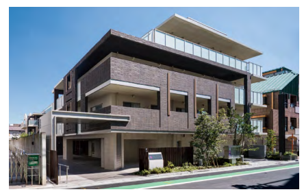
Grapes With Yotsuya