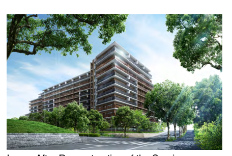
Image After Reconstruction of the Senri Tsukumodai A Subdivided Condominium

Tokyo Tatemono is participating in the Senri Tsukumodai A Subdivided Condominium Reconstruction Business in Senri New Town. Senri Tsukumodai A Subdivided Condominium Reconstruction Business is an association-type implementation of condominium redevelopment in accordance with the first Act on Facilitation of Reconstruction of Condominiums in Suita City. All of the residence from 2015 will work together with this project, and we expect every right holder will move in from December 2019.