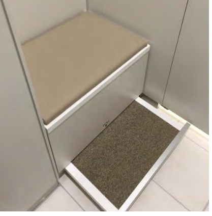
Installation of Bench with Fitting Board in Dressing Rooms

The Empire Building completed in September 2017 was a reconstruction business conducted jointly with Empire Motor following the deterioration of the head Empire Motor head office building. We poured our strength into a work-friendly office for women that of course provided the latest functionality and high earthquake resistance. We conducted a survey with the female employees who work at Tokyo Tatemono and reflected the feedback we received in the plans for the facility.