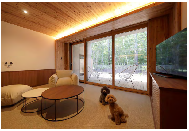
A resort both people and their beloved dogs can enjoy (Regina Resort Kyukaruizawa shown in the picture)

Regina Resort run by Tokyo Tatemono Resort always keeps in mind guests accompanied by their beloved dogs from the planning stage of facilities. This resort hotel is able to accommodate beloved dogs comfortably, from floors resistant to damage and dirt, various amenities, private dog runs for each guest, and insurance systems for indemnification of accidental damage to facilities. As a resort hotel, Regina Resort also brings high-quality and enhanced services in addition to creating new value as a resort where people and beloved dogs can both relax. Currently, we have expanded to six locations in the Kanto and Koshinetsu area.