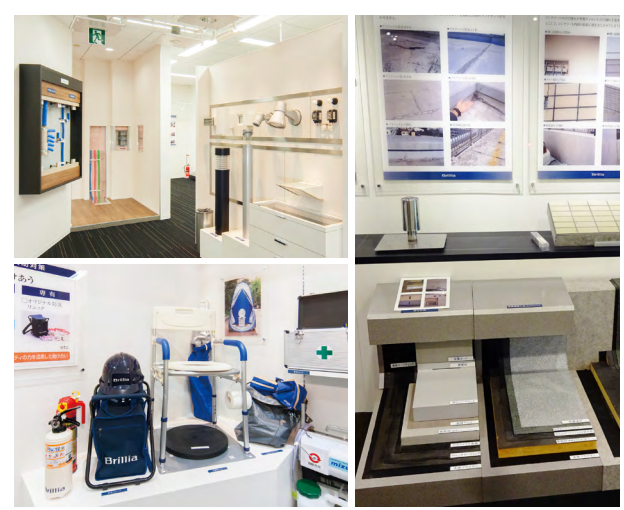
The training utilizes the equipment, tools, and construction materials that are actually used

Moreover, Tokyo has certified the center as a vocational training school based on the Human Resources Development Promotion Act and nurtures new condominium property managers through high-quality vocational training.