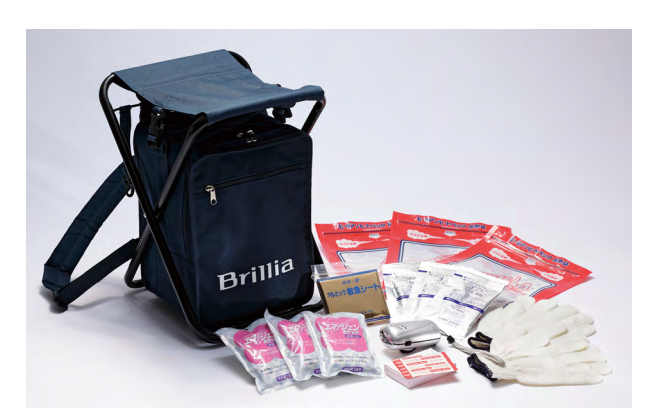
Brillia original disaster prevention backpack

The guidelines received the Good Design Award in the Service Design Category in 2011 for its daily awareness raising about disaster prevention and improving awareness between residents being highly evaluated.