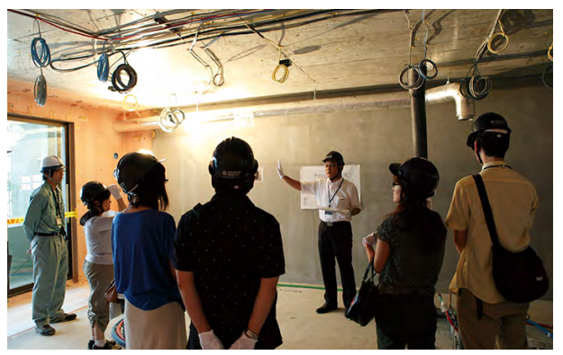
On-site Tour of Framework and Concrete Walls

The tour guided by on-site staff explains construction and enables customers to see each stage of construction which cannot be seen after completion. Customers have told us these tours are easy to understand because they provide explanations that use specific examples without technical terminology.