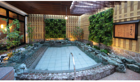
Spacious Open-air Bath (Ofuro no Osama Oimachi shown in the picture)

Through these types of initiatives, we are striving to provide a space where customers can relax in comfort.