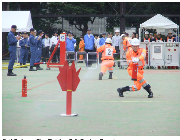
Self-Defense Fire-Fighting Drill Review Board

excellence in first-aid from the Tokyo Fire Department to become business establishments encouraging first-aid.