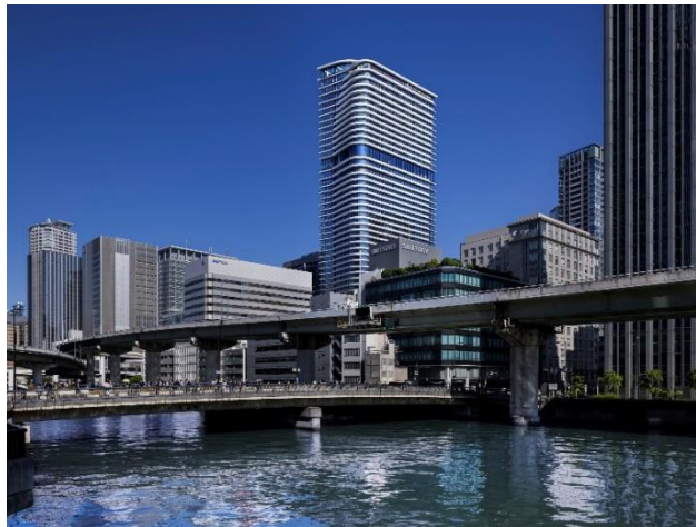
Exterior of "ONE DOJIMA PROJECT"

This is the first project in Japan* to develop an ultra-high-rise mixed-use building comprising the Four Seasons Hotel and apartments. Standing 195m tall and 49 stories above ground, the building itself can be regarded as an artwork; the upper floors of the building are gradually set back, and three types of balcony have been combined to create a symbolic exterior reminiscent of a yacht's sail, a fitting design for Osaka, which is known for its waterways. Under the supervision of curator and art critic Fumio Nanjo, the residential communal areas are sophisticated spaces, featuring around 50 works of art, including pieces by the world-renowned sculptor, Kohei Nawa.