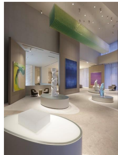
Gallery Corridor ( on the second floor)