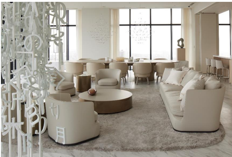
The Penthouse (Party room on the top floor)

On the apartment floors, there is a private party room offering panoramic views of Osaka on the top floor, as well as a fitness room, working booths, and other communal facilities to meet a wide variety of needs.