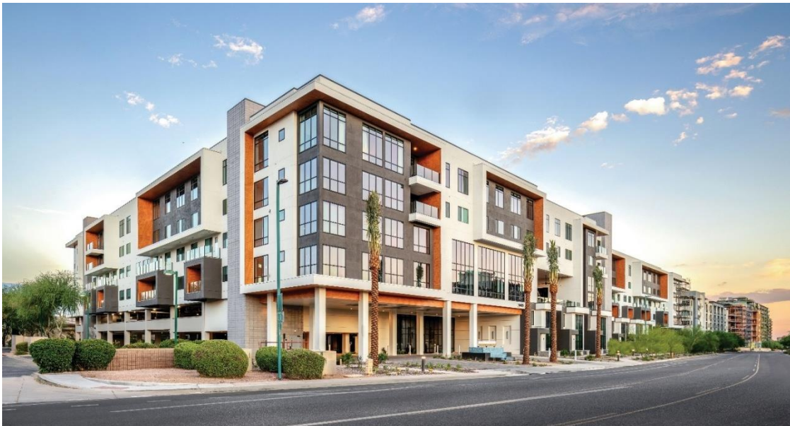
Exterior of Residences Kierland, the acquired property