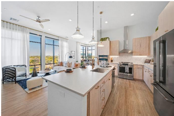
Living room (two-bedroom unit)

The Property comprises a total of 290 units with mostly one- or two-bedroom floor plans. Unit interiors reflect luxury-residence-quality specifications, including the adoption of furnishings and appliances such as wine refrigerators and designer cabinetry. Select units also offer views of a golf course located directly in front and surrounding mountain ranges. Extensive shared amenities including a full-service spa, pool, and fitness center help to clearly differentiate the Property from others in the area.