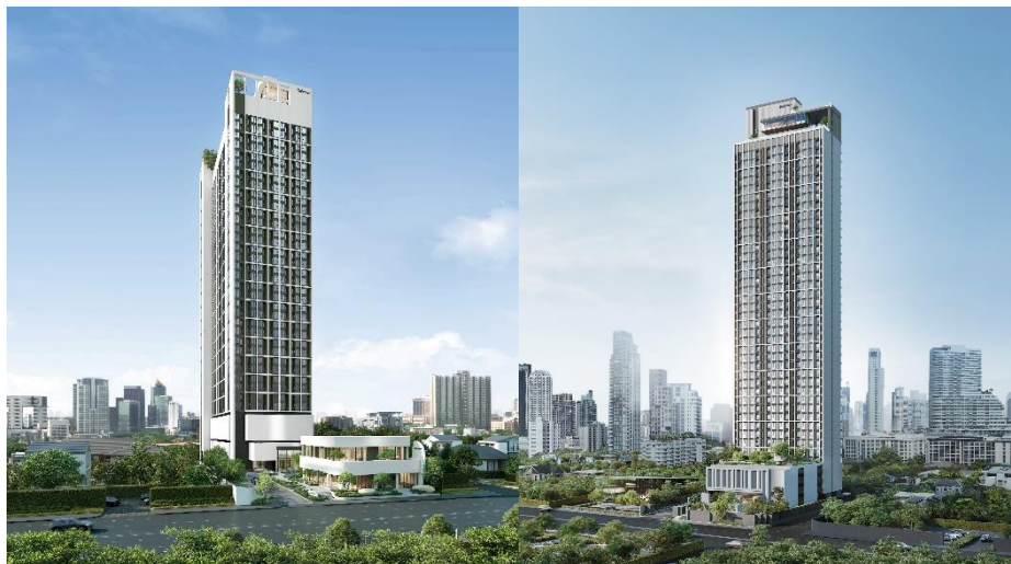
Reference Kaset District Project (left) and Reference Ekkamai Project (right)